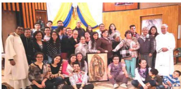
Marist Laity after making his commitment promise, CPU

We concluded with Holy Mass and twenty Laity made their Marist commitment for the first time.