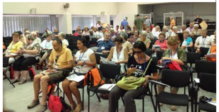
Participants at the Los Negrals Conference

We have planned a meeting in Europe for February on the theme “How can we promote Marist Laity and our common mission following on from the Los Negrals conference?” Let’s give ourselves a deadline