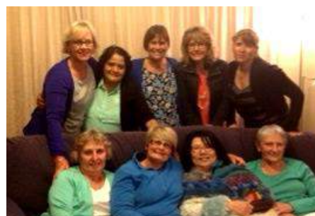
Marian Mothers, Henderson November 2015