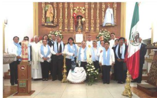
Marist Laity of the Parish of San Bernardino, Toluca,